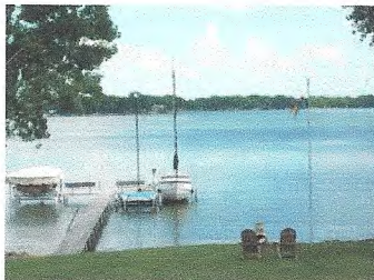
View from the Cabin